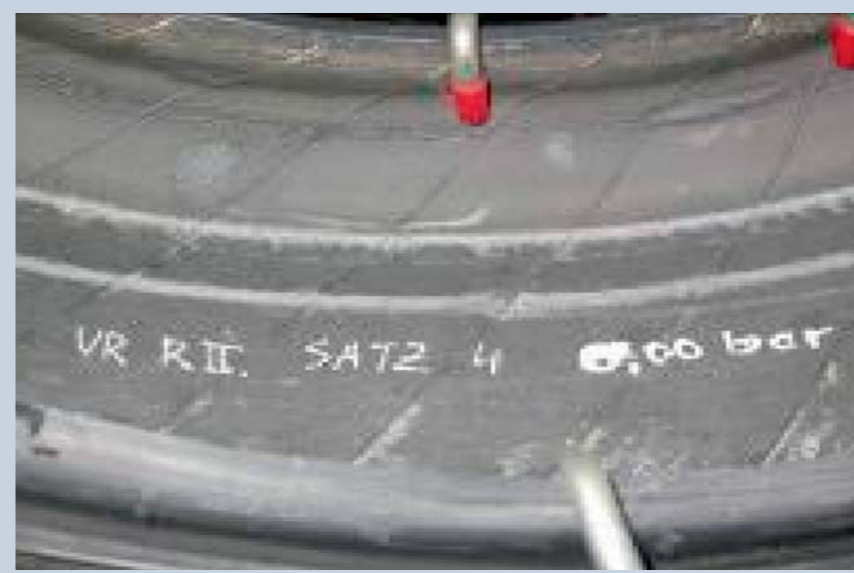
Clearly visible strips with pronounced wrinkles