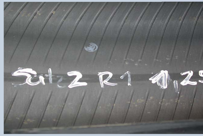
Dark strips, but no damage