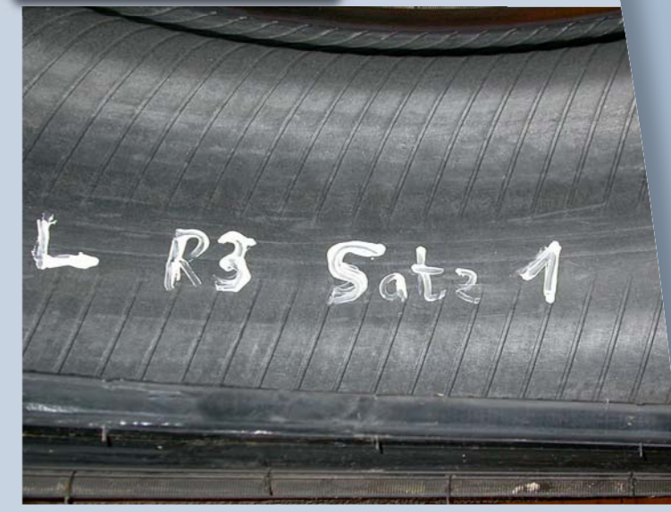
Dark strips, but no damage