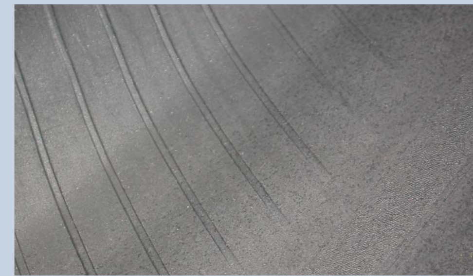
Dark and wide strips