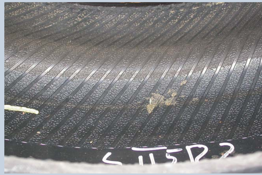
No damage visible