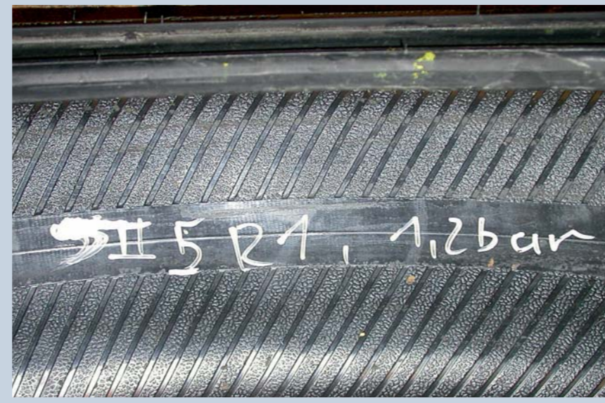
No damage visible