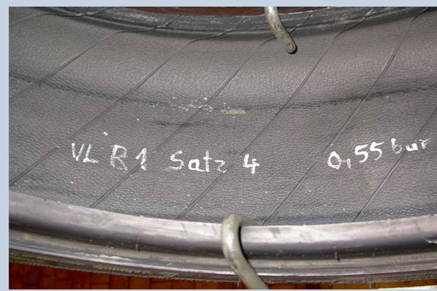
Clearly visible strips with wrinkles