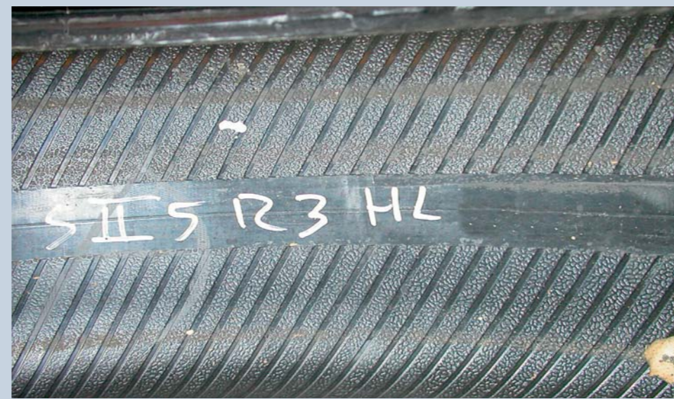
Bright strips clearly visible in flexing zone