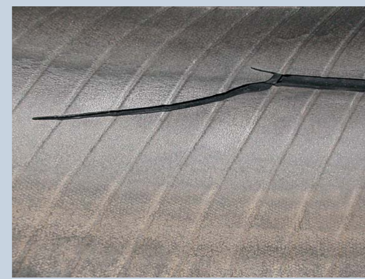
Breakage / rip in sidewall reinforcement